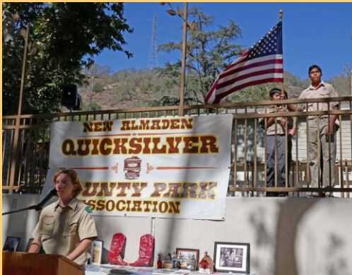
Boy Scout Troop 290

The fabulous Stargeezers entertained us with a delightful mixture of musical genres and humor. They were a lot of fun and perfectly complimented our event.