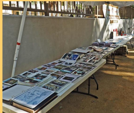
40 years of NAQCPA photos