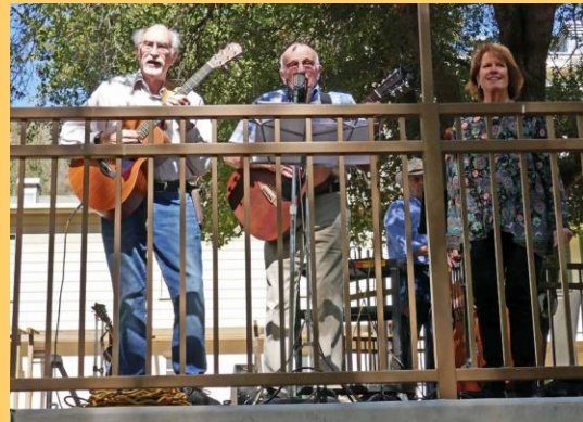
The fabulous Stargeezers